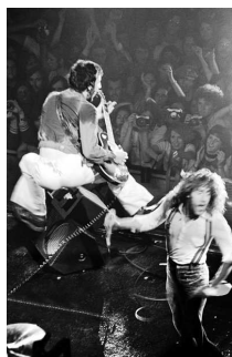
The Who, shot by Neal Preston in San Francisco, 1971

The first time we did an exhibition at Lightpower in Germany, I walked in and asked, “Are you telling me one person shot all of these?” It was an out-of-body experience. People tell me, “I can hear the music when I look at these,” and it’s mind-blowing. I know I’ve done my job well.