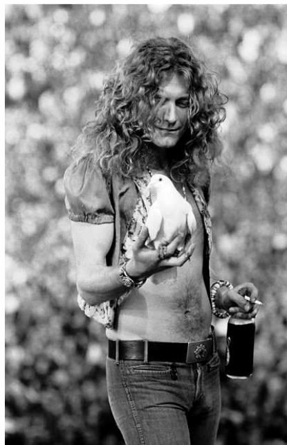
Robert Plant in San Francisco, 1973

Springsteen, Billy Joel, Madonna, Michael Jackson, The Rolling Stones, Wham! and so many more. He shot Live Aid in 1985, and logged more than 700 shoot days with People Magazine . Let’s learn more from Neal.