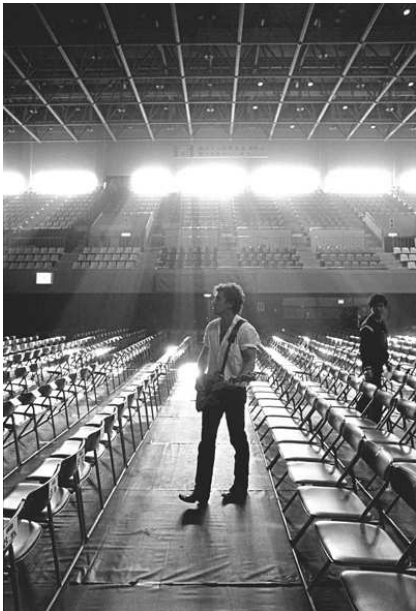
The Boss in Kyoto, Japan, 1985

might have no health insurance. My dad would have loved it!