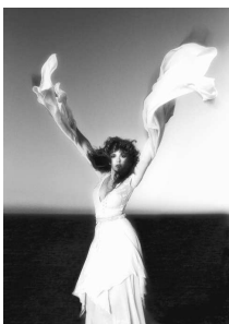
Stevie Nicks on a rooftop in 1981

I finally shot Courtney Love , with her genius-level IQ and all her pizzazz. Christina Aguilera is on my list, for sure.